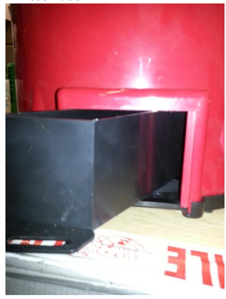
Remove cash draw from machine