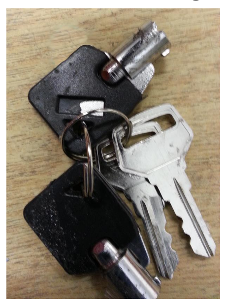
Find the correct key to the metal cash door