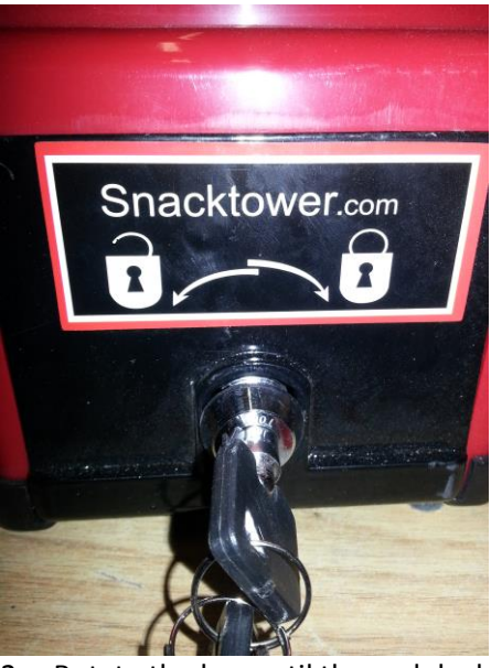
Rotate the key until the cash lock 3. Remove the silver locking bar 2. has been removed