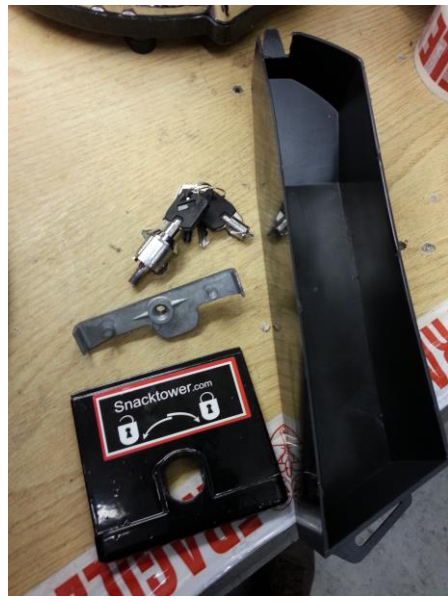
You should now have removed the above items