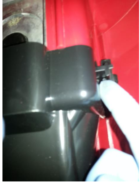
Using your index finger push up the locking black bar