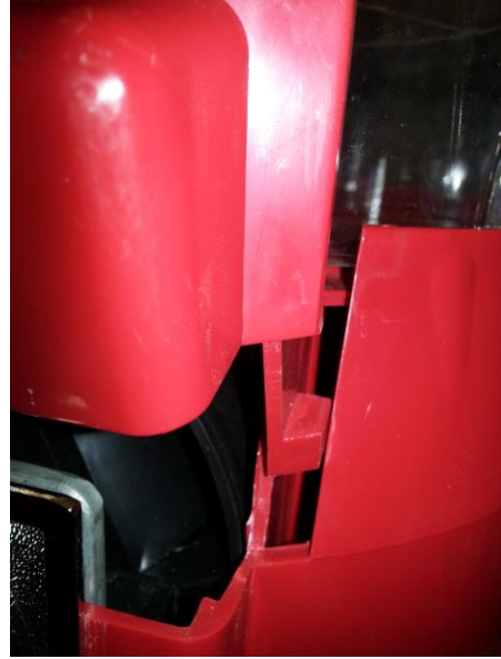
The front panel should now be free to remove