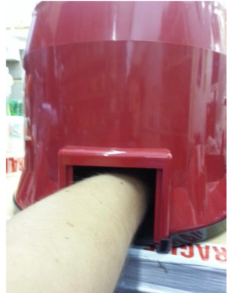
6. Reach in to the machine with right palm facing centre.