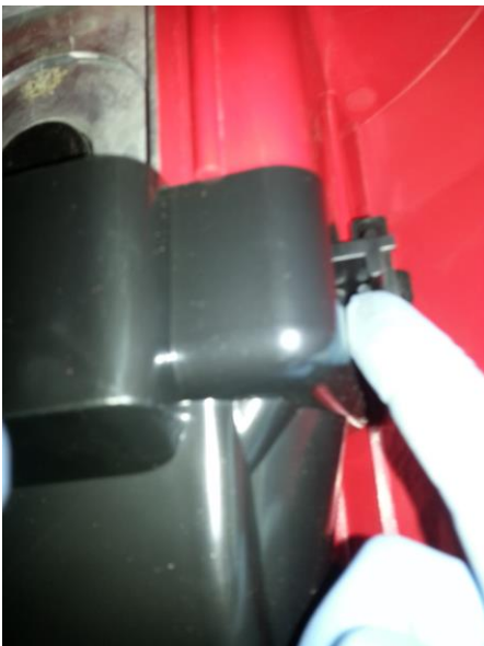
7. Using your index finger push up the locking black bar