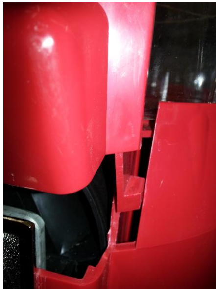
8. The front panel should now be free to remove