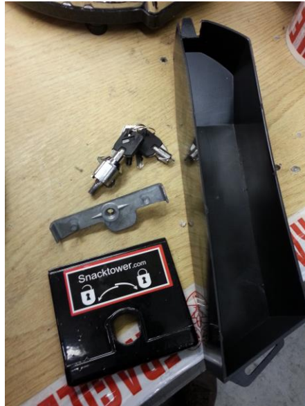
5. You should now have removed the above items