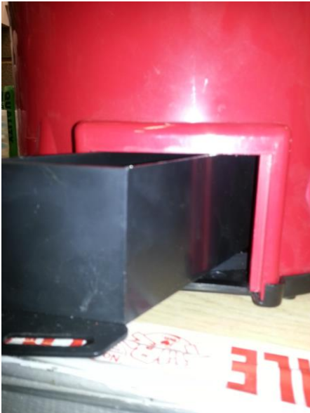
4. Remove cash draw from machine