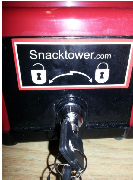
2. Rotate the key until the cash lock has been removed