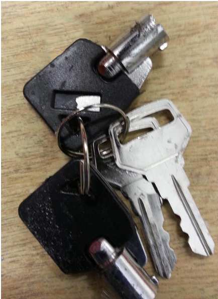
1. Find the correct key to the metal cash door