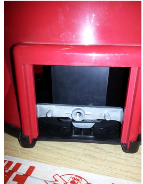
3. Remove the silver locking bar